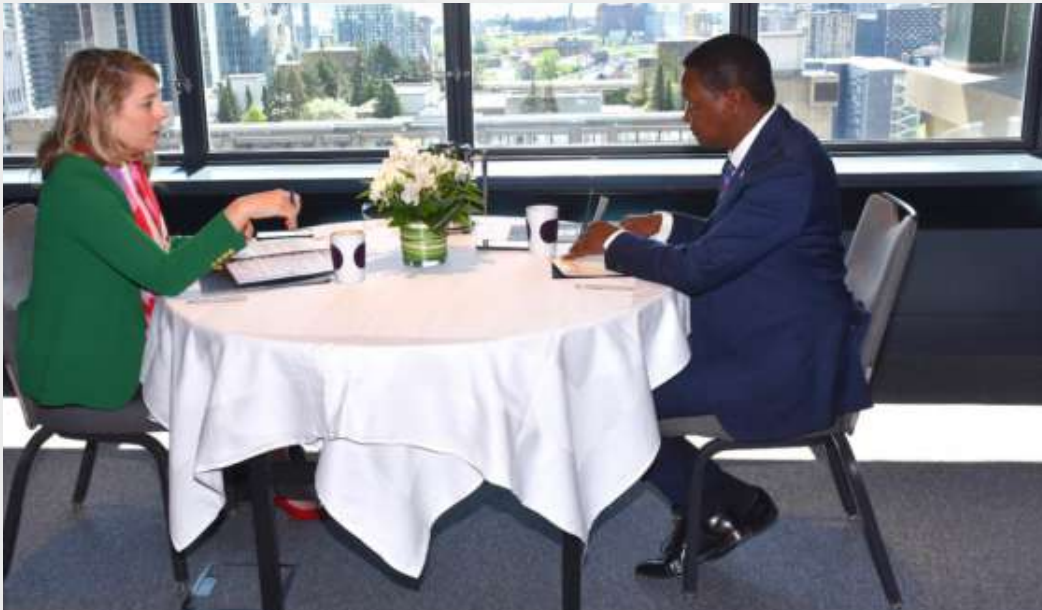
CS Dr. Alfred Mutua with his Canadian Counterpart Hon. Mélanie Joly in Montreal, Canada on May 15, 2023

Dr. Alfred Mutua, Cabinet Secretary for Foreign and Diaspora Affairs made an official visit to Canada where he met with his Canadian Counterpart Hon. Mélanie Joly, on May 15, 2023 and deliberated on the progress made toward achieving the common goals as envisioned under the Kenya-Canada Binational Commission.