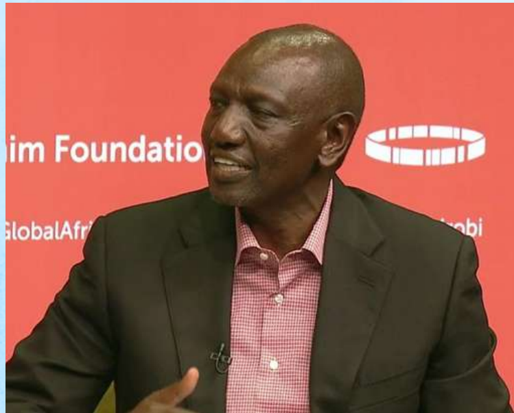
H.E. President William Ruto speaks during a one-on-one conversation with Sir Mohammed Ibrahim, Founder and Chair of Mo Ibrahim Foundation on the ongoing climate change debate.

This year's IGW was centred on the key role that the continent can play, its potential as well as what it requires to offer solutions to the multiplying and cumulative global challenges such as climate change, pandemics and conflicts.