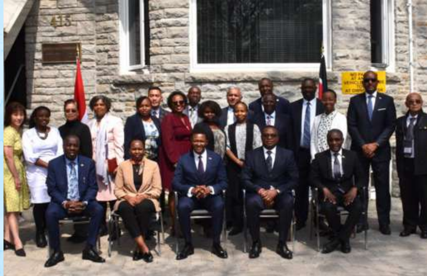
CS Dr. Alfred Mutua, with Kenya High Commission Staff in Ottawa on May 16, 2023.

The CS also urged Canada to advocate for favourable international finance system within the G7 to enable developing countries to access affordable credit within the Multilateral system.