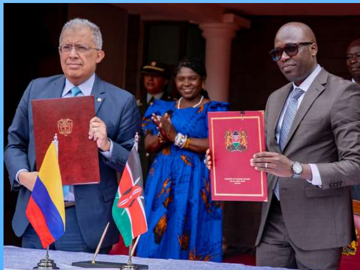
PS Dr. Korir Sing'oei joined H.E. Rigathi Gachagua during the political consultation with Vice President of the Republic of Colombia H.E. Marguez Mina on May 15, 2023 at the Deputy President's official residence

"It is a bold step that will directly contribute to the realisation of the Bottom-Up Economic Transformation Agenda," the DP said, adding that, "We look forward to fostering the existing relations between the two countries in dignifying our people."