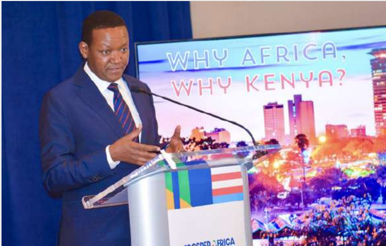
CS Dr. Alfred Mutua delivers a keynote speech at the inaugural Kenya-US Business Roadshow at the Harvard Club in New York on April 26, 2023

On April 26, 2023, Cabinet Secretary Dr. Alfred Mutua, delivered the keynote speech at the inaugural Kenya-US Business Roadshow at the Harvard Club in New York, USA. The roadshow attracted a wide array of American investors and business people who were eager to understand investment opportunities in Kenya.