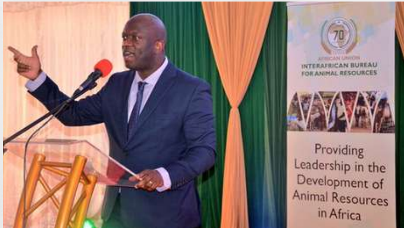
PS, State Department for Trade, Alfred Ombudo K’Ombudo presides over Africa Day celebrations in Nairobi on May 25, 2023.

The event was attended by Eritrean Ambassador Beyene Russom, who also serves as the country’s envoy to UNEP and UN-Habitat among other Ambassadors.