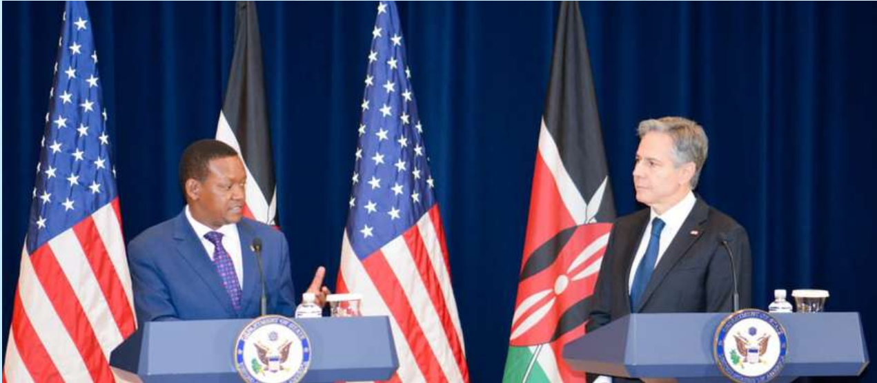
CS Dr. Alfred Mutua and US Secretary of State Hon. Antony Blinken during a Joint Press Conference on the Third U.S.- Kenya Bilateral Strategic Dialogue held at the State Department in Washington DC in Washington DC on April 25, 2023

After weeks of friendly negotiations as partners, Cabinet Secretary Dr. Alfred Mutua, co-chaired the Kenya - United States Strategic Bilateral Dialogue with Secretary of State Anthony Blinken in Washington DC on April 25, 2023. The CS was accompanied by CS Moses Kuria alongside other senior government officials.