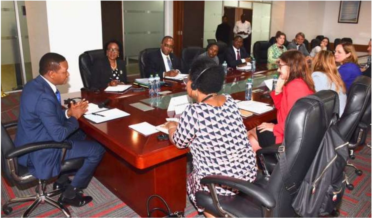
Dr. Alfred Mutua met with the European Parliament Development Committee on partnerships with Kenya on April 3, 2023