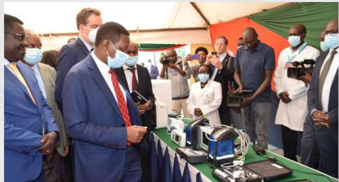
CS Dr. Alfred Mutua inspects medical equipment at the Moi Teaching and Referral Hospital in Uasin Gishu County on February 22, 2023.