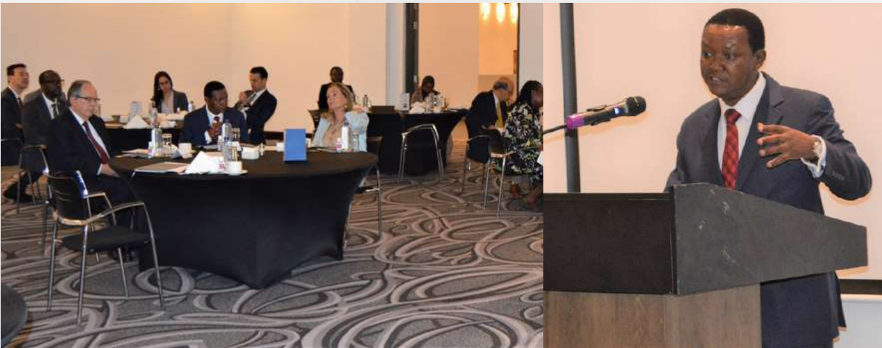
Dr. Alfred Mutua hosted the Ambassadors and High Commissioners from the Americas and the Caribbean region based in Nairobi on February 10, 2023