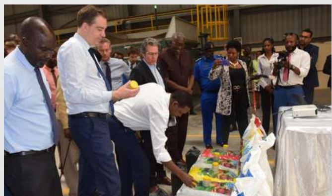
CS Dr. Alfred Mutua and the French Minister visited a French owned fertilizer producing and blending plant, Baraka-Timac Agro Plant on February 22, 2023.