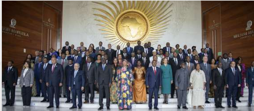
The 42nd Ordinary Session of AU Executive Council held in Addis Ababa, Ethiopia on Feb 15, 2023

The CS held discussions with AU Commission Chairperson Moussa Faki where both discussed peace and security in the African Continent as well as Kenya's key role in democracy, peace stability and development of Africa's member states.