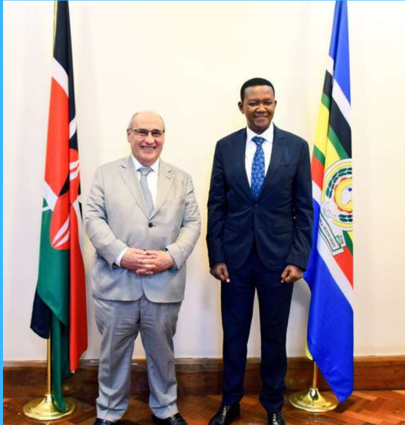
CS Dr. Alfred Mutua with Mr. Antonio Vitorino, Director-General of International Organization for Migration (UN Migration) on February 13, 2023.

The plan provides a flexible mechanism for all stakeholders to respond to evolving migration trends, and broader humanitarian and development challenges affecting migrants, host communities and the respective governments.