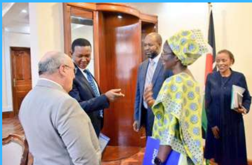
CS Dr. Alfred Mutua with IMO team lead by Mr. Antonio Vitorino, Director-General of International Organization for Migration (UN Migration) on February 13, 2023.

Funding will further help efforts towards addressing the drivers of irregular migration and strengthen the capacity of governments in the region on migration management, including in ensuring greater coordination and collaboration.