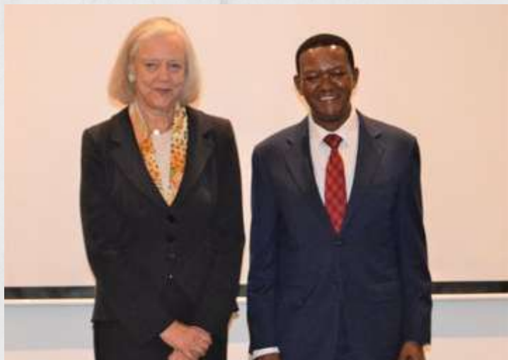
CS Dr. Alfred Mutua with Amb. Margaret Whitman, U.S. Ambassador to Kenya

CS Mutua thanked the diplomats for their support to Kenyans abroad.