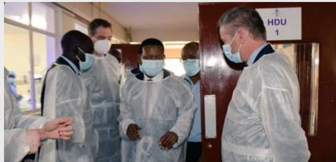
CS Dr. Alfred Mutua together with the French Minister toured the hospital's maternity and Children's wards at the Moi Teaching and Referral Hospital in Uasin Gishu County on February 22, 2023.