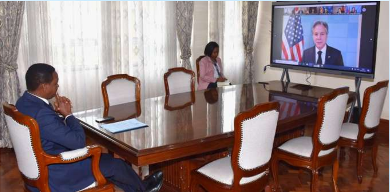
CS Dr. Alfred Mutua participated at the COVID-19 Global Action Plan (GAP) Virtual Ministerial Meeting convened and presided by the US Secretary of State on February 8, 2023.