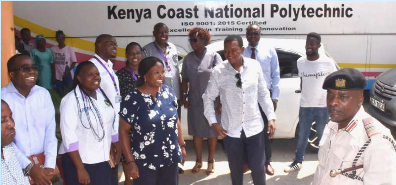
CS Dr. Alfred Mutua during the official visit to Kenya Canadian bilateral projects in the coastal region on February 11, 2023.