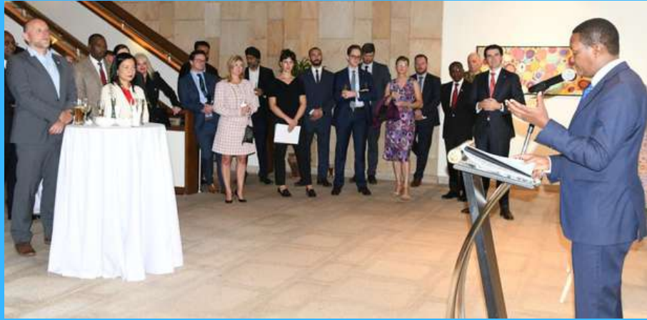
CS Dr. Alfred Mutua gives key note address during the opening ceremony of the Australian High Commission Chancery in Nairobi on February 21, 2023.