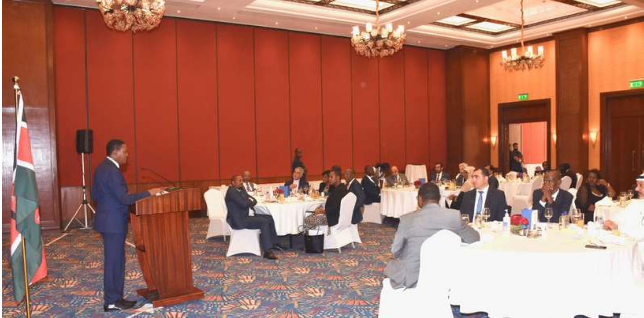
CS Dr. Alfred Mutua addresses Envoys from the Middle East region when he hosted them for Lunch on February 8, 2023

In an effort to foster economic and social relations between Kenya and countries in the Middle East region, Cabinet Secretary, Dr. Alfred Mutua hosted the Ambassadors from the Middle East region for a luncheon on February 8, 2023.