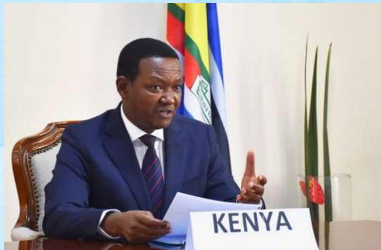
CS Dr. Alfred Mutua participates at the Covid-19 Ministerial Virtual Meeting

CS Mutua appealed to participants for concerted global efforts in addressing the challenges of Covid-19 and other future pandemics. The Covid-19 pandemic had demonstrated the need to strengthen the capacities of all countries, especially African States and other institutions for better respond to similar pandemics in future.