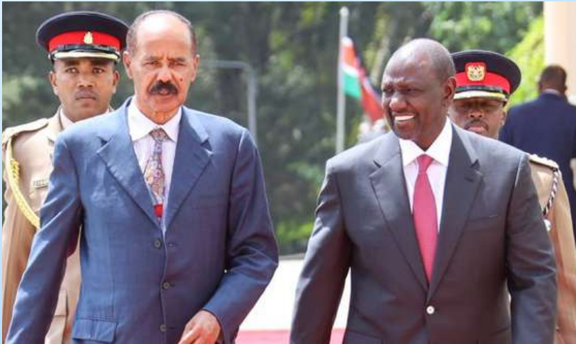
H.E. President William Ruto and H.E. Isaias Afwerki, President of Eritrea at Statehouse Nairobi on February 8, 2023.