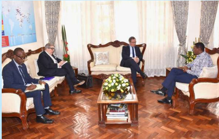
CS Dr. Alfred Mutua hold discussions with Finland's Minister for Economic Affairs, Mika Lintila on February 2, 2023.

The CS appealed for more commercial engagements in the areas of ICT, technology cooperation, environmental and circular economy, investments and renewable energy.