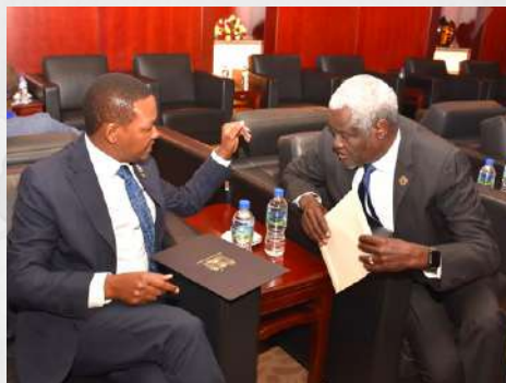
CS Mutua held discussions with AU Commission Chairperson Moussa Faki on the side-lines of the AU Summit

The main purpose of the treaty is to enhance manufacturing of medicines and vaccines for African use and also to be able to purchase or bargain for a good price for medicines being imported into the continent.