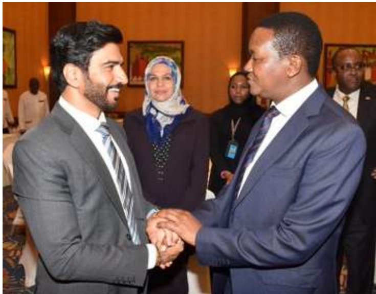
CS Dr. Alfred Mutua with Middle East Region Envoys

"250,000 Kenyans are currently residing and working in Middle Eastern countries"