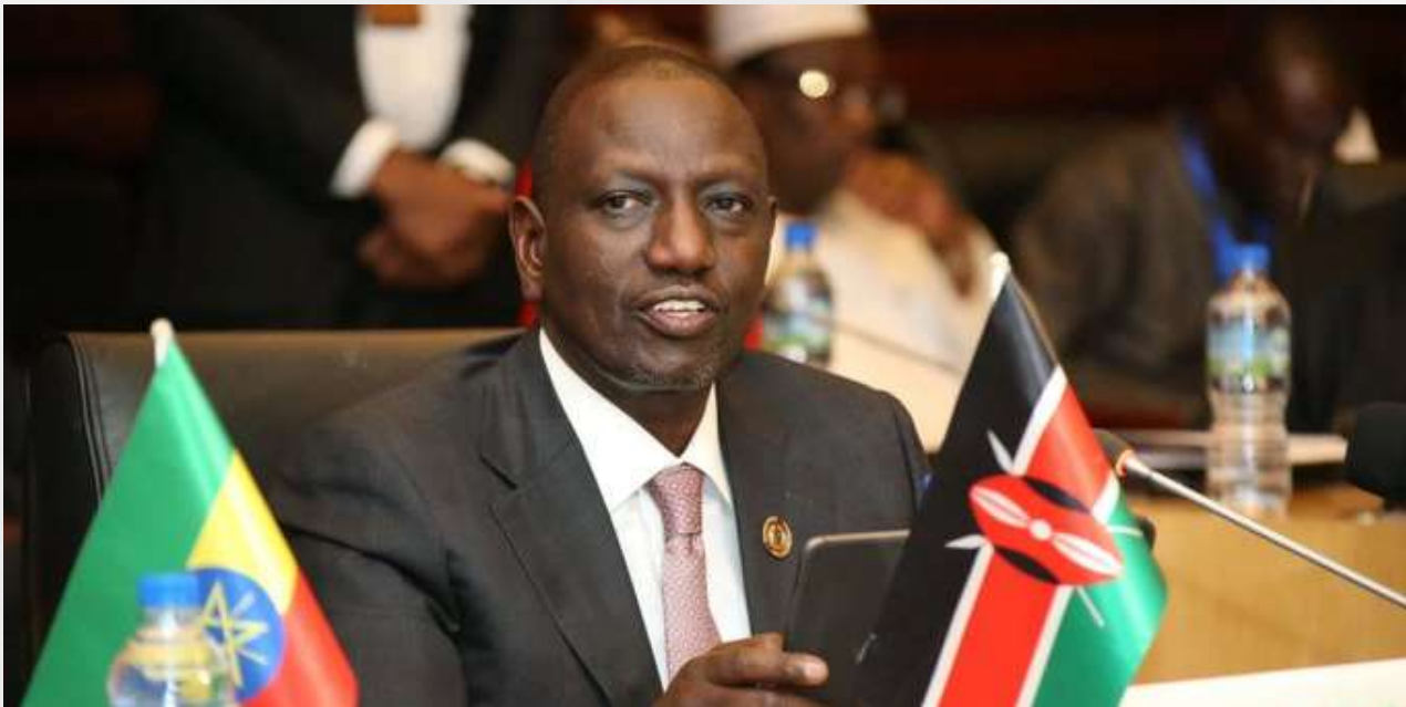
H.E. President William Ruto addressing the conference of Heads of State and Government of the Climate Commission for the Sahel Region, at the AU Summit in Addis Ababa, Ethiopia on February 17, 2023