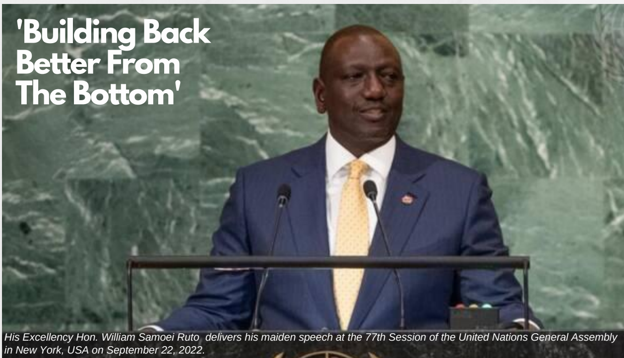
His Excellency Hon. William Samoei Ruto delivers his maiden speech at the 77th Session of the United Nations General Assembly in New York, USA on September 22, 2022.