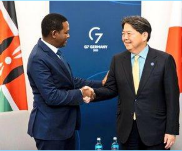
CS Dr. Alfred Mutua with Japanese Foreign Minister H.E. Hayashi Yoshimasa