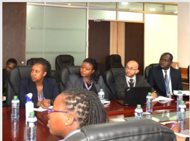
Third Secretaries undergoing the training which is part of mentorship and coaching for effective delivery of the Ministry's mandate.