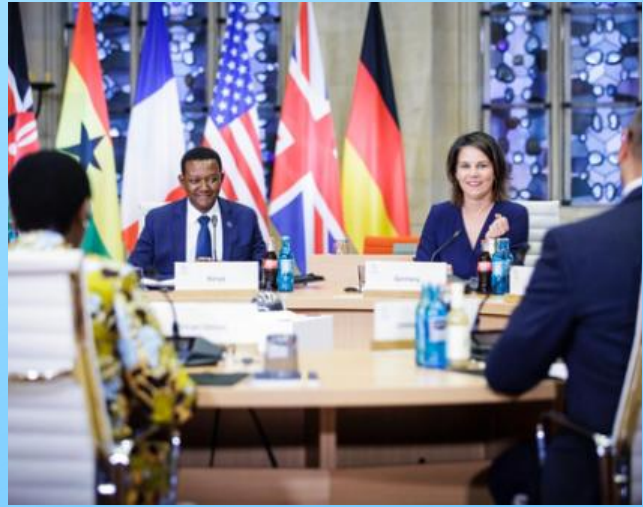
CS Dr. Alfred Mutua attends G7 Ministerial meeting in Munster, Germany.