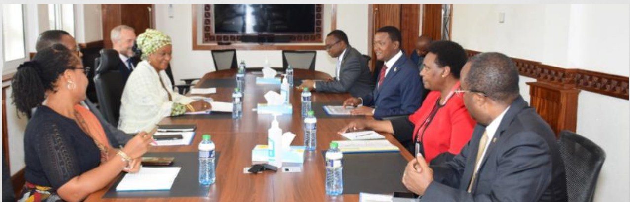
Dr. Alfred Mutua, Cabinet Secretary for Foreign and Diaspora Affairs with H.E. Madam Zainab Bangura, Director General United Nations Office in Nairobi (UNON) on November 2, 2022

The Cabinet Secretary emphasized that Kenya will support and create strategic partnerships with the UN that have positive impact to humanity.