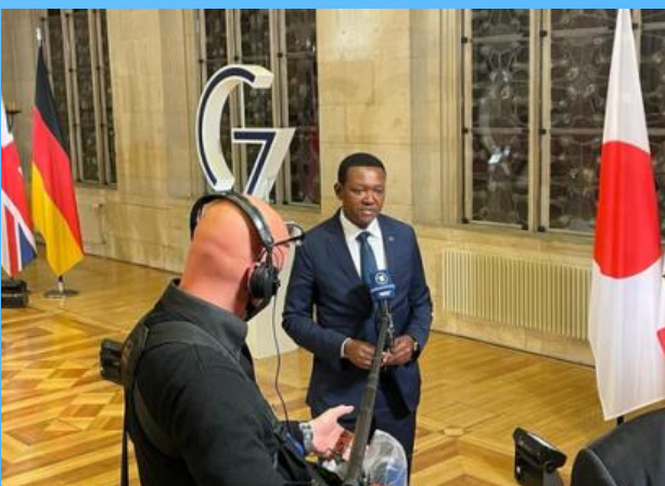
CS Dr. Alfred Mutua during a press conference after attending the G7 Foreign Ministerial meeting