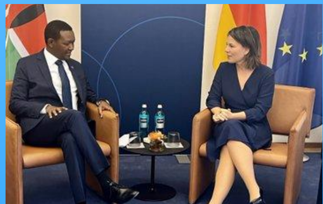
CS Dr. Alfred Mutua with German Foreign Minister H.E. Annalena Baerbock