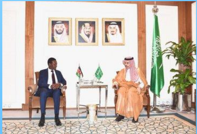
CS Dr. Alfred Mutua held bilateral talks with his counterpart H.R.H. Prince Faisal Bin Farhan Alsoud, Minister of Foreign Affairs of the Kingdom of Saudi Arabia on November 2, 2022

“Listening to the Kenyans, agents, Kenya Government officials and Saudi Government officials, it is clear that the problems facing some of our people start back home due to flawed and corrupt systems. There is massive corruption in the way Kenyans are prepared before they leave to take up domestic work in Saudi Arabia and their follow up when they arrive,” the CS stated adding that this was a major concern to both Governments and pledged to break cartels and the unscrupulous agencies.