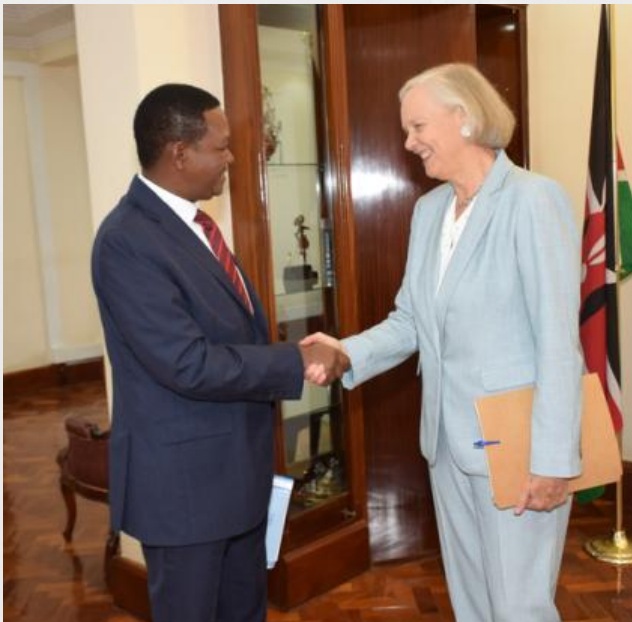
Dr. Alfred Mutua, Cabinet Secretary for Foreign and Diaspora Affairs with H.E. Meg Whitman, U.S. Ambassador to Kenya on November 2, 2022