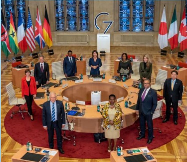
CS Dr. Alfred Mutua attends G7 Ministerial meeting in Munster, Germany on November 4, 2022

On matters of International Peace and Security, the Cabinet Secretary reaffirmed Kenya's principled stand on adhering to an effective rule based multilateral system that is responsible to the current global challenges. Noting that, this is the basis that informs Kenya's role as an anchor state and guarantor of regional peace and security.