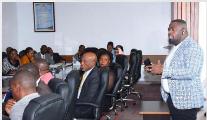
Representatives of employment agents who recruit Kenyans for jobs in Saudi Arabia and other region.

The Government will also facilitate the recruitment agencies to be able to conduct their business successfully for the benefit of Kenyans.