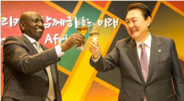
H.E. President William Ruto with his host H.E. President Yoon Suk Yeol toast during the bilateral meeting in Seoul, South Korea.