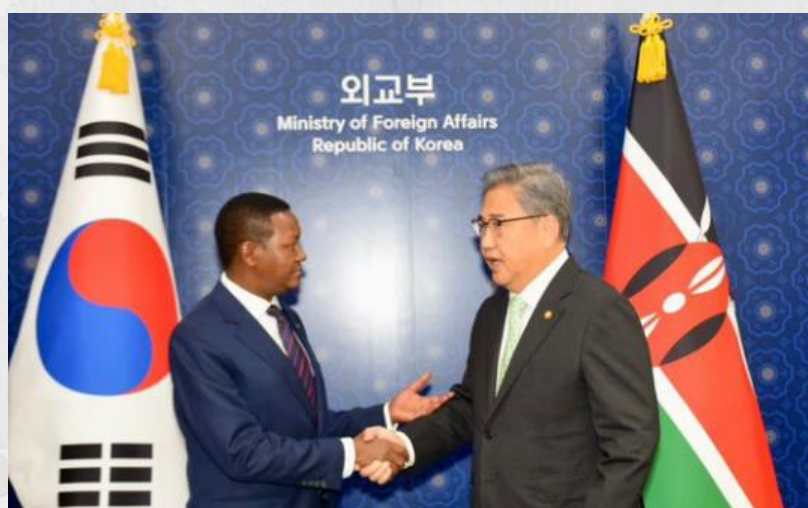
CS Dr. Alfred Mutua with his counterpart, Dr. Park Jin - Minister for Foreign Affairs, South Korea.