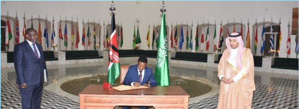
CS Dr. Alfred Mutua, Cabinet Secretary for Foreign and Diaspora Affairs made a two-day official visit to the Kingdom of Saudi Arabia between November 2 – 4, 2022.