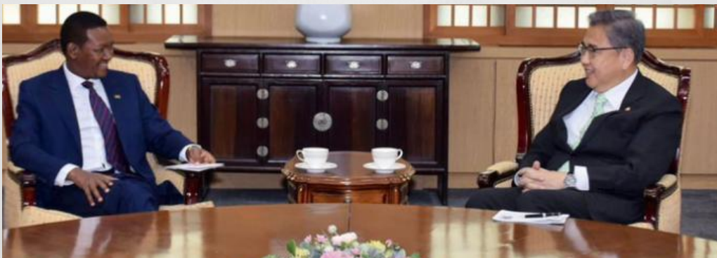
CS Dr. Alfred Mutua while in Seoul, South Korea, held a meeting with his counterpart, Dr. Park Jin - Minister for Foreign Affairs.