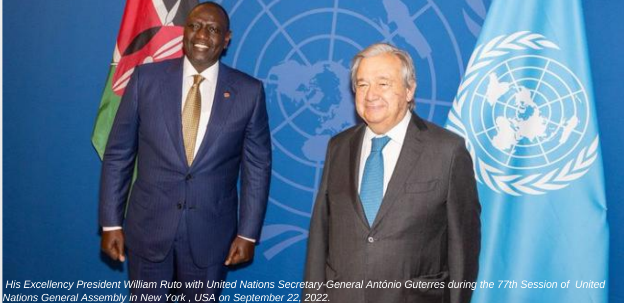
His Excellency President William Ruto with United Nations Secretary-General António Guterres during the 77th Session of United Nations General Assembly in New York , USA on September 22, 2022.