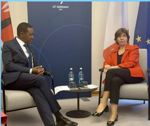
CS Dr. Alfred Mutua with French Foreign Minister H.E. Catherine Colonna