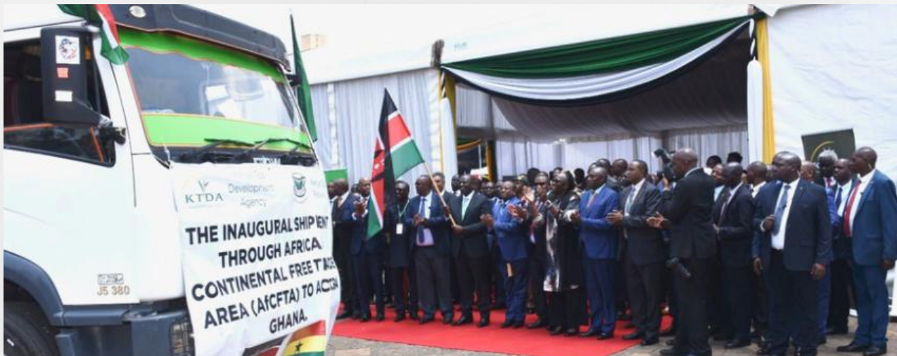
H.E. President William Ruto flags off the inaugural consignment of Kenya value-added tea to Ghana under the Africa Continental Free Trade Area (AfCFTA) on October 5, 2022.