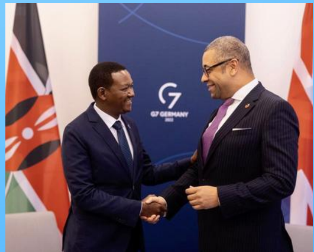
CS Dr. Alfred Mutua with United Kingdom Secretary of State H.E. Ames Cleverly