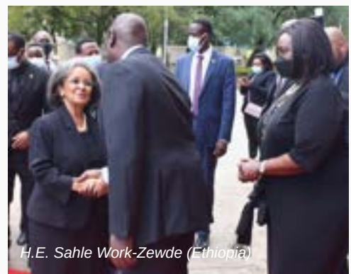
H.E. Sahle Work-Zewde (Ethiopia)