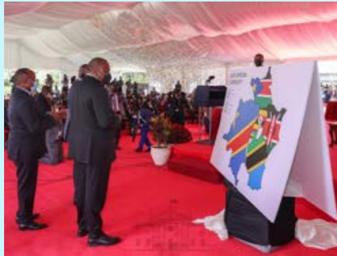
H.E Felix Antoine Tshisekedi, President of the Democratic Republic of Congo (DRC) together with President Uhuru Kenyatta, Chair of the EAC Summit of Heads of State signed the treaty of Accession by Democratic Republic of Congo to the East Africa Community (EAC) on April 8, 2022

This clique, however, did not have experience in political organization and split immediately after independence. Political and military rivals challenged the newly independent state until Mobutu Sese Seko forged an elite consensus by buying in or crushing rival groups.