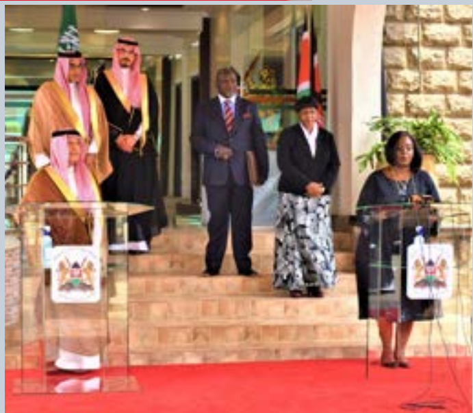
CS Amb. Raychelle Omamo held a press briefing on the visit by the Special Envoy from the Kingdom of Saudi Arabia H.E. Minister Ahmed Bin Abdulaziz Kattan, who delivered a good will message to H.E President Uhuru Kenyatta from King Salman Bin Abdulaziz Al Saud of Saudi Arabia on April 13, 2022

In a press briefing held at the Ministry of Foreign Affairs after the State House meeting, Cabinet Secretary Amb. Raychelle Omamo confirmed that Kenya looks forward to participate in the two summits.