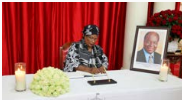
Former President of Malawi Joyce Banda

Kenya's third President, His Excellency Mwai Kibaki passed away at the age of 90 years on April 22, 2022. The Late President served Kenya as third President for 10 years (2002 to 2013) and Member of Parliament for 50 years (1963 to 2013).