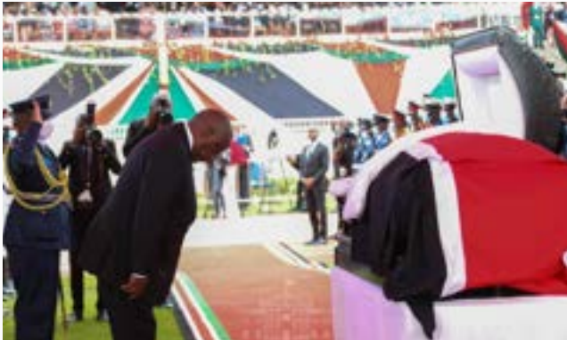
H.E. Cyril Ramaphosa (South Africa)