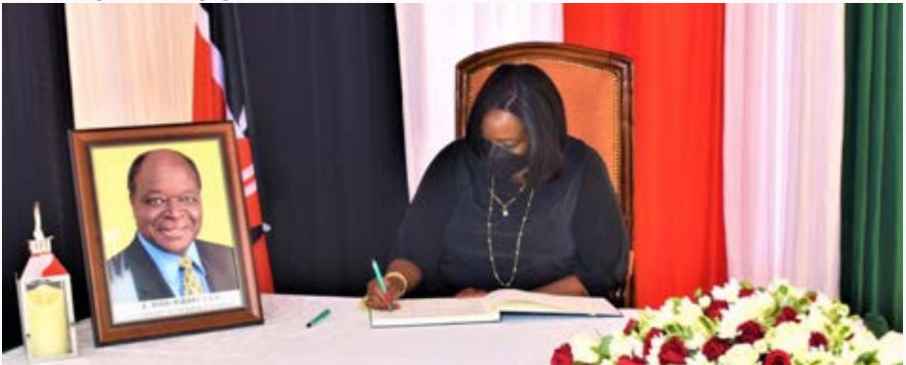
CS Amb. Raychelle Omamo signs the Condolence Book in honour of the Late H.E. Mwai Kibaki at the MFA office on April 26, 2022

Following the passing on of Kenya's third President His Excellency Mwai Kibaki on April 22, 2022, Foreign Affairs Cabinet Secretary Amb. Raychelle Omamo extended her deepest sympathies to his family and the entire nation at large.