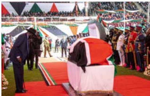
H.E. Salva Kiir (South Sudan),