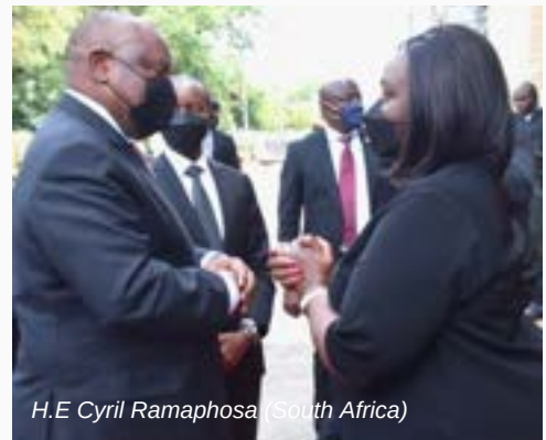
H.E. Cyril Ramaphosa (South Africa)

May the soul of His Excellency Mwai Kibaki rest in eternal peace.