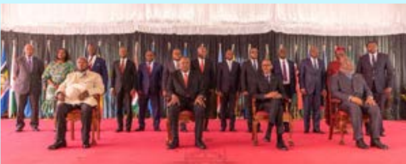
Group photo of EAC Ministers with Heads of State: H.E Uhuru Kenyatta Chair of the EAC Summit, H.E Felix Tshisekedi, new member of EAC Heads of State Summit, H.E Yoweri Museveni and H.E Paul Kagame on April 8, 2022.

For Kenya, as heralded by President Uhuru Kenyatta's foreign policy priorities for peace and security in Ethiopia, South Sudan, Sudan and now the DRC, the focus is singular, the paradigm is Afro-centrism and African solution holds sway. The alternative is a situation where the status quo, and especially the violence, will continue to simmer and embroil the Kivus and the entire region straddling the Indian and Atlantic oceans. It is an unpalatable option that Kenya is working to roll back with recent initiatives such as the holding of the Quintet Summit on Peace and Security in Eastern DRC on 21 April 2022 that brought Burundi, DRC, Kenya, Rwanda and Uganda to Nairobi.