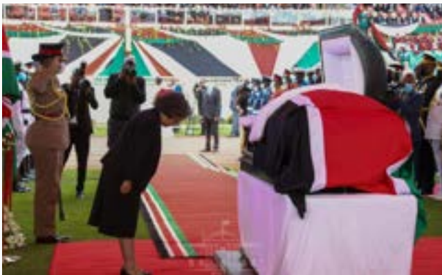
H.E. Sahle Work-Zewde (Ethiopia)