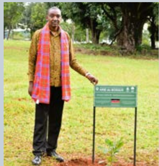
Amb. Kaanto also installed a commemorative plaque paying tribute to the 2004 Nobel Peace Prize Laureate.