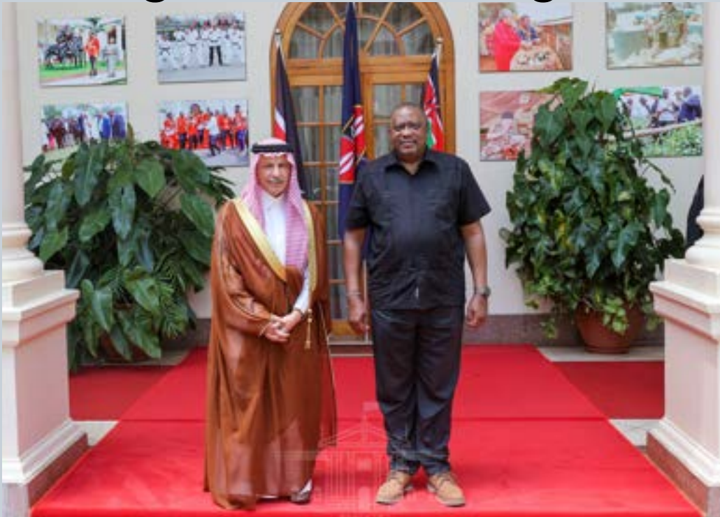
President Uhuru Kenyatta with Special Envoy H.E Minister Ahmed Bin Abdulaziz Kattan who delivered a special message from King Salman bin Abdulaziz Al Saud of Saudi Arabia on April 13, 2022

Kenya and Saudi Arabia continue to exemplify existing relations between the two friendly countries as evidence by the continued efforts to solidify expanding and deepening ties.