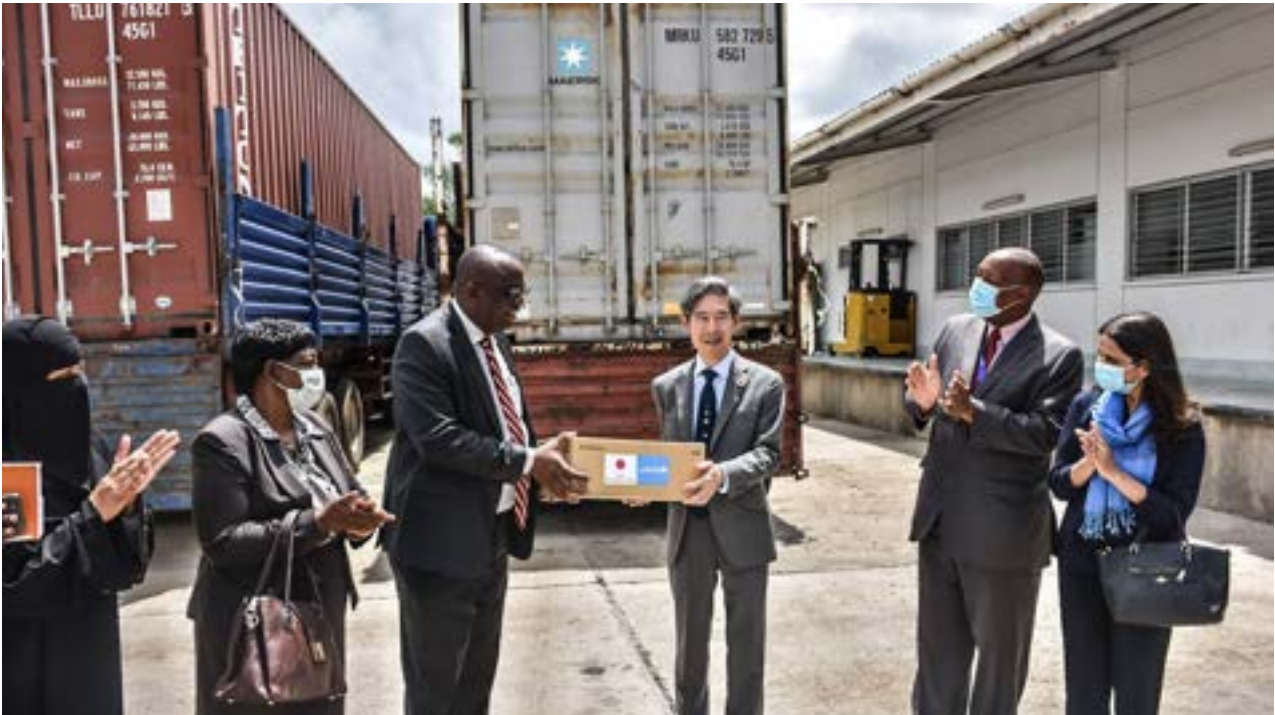
The Japanese Ambassador to Kenya Amb. Okaniwa Ken handed over a donation of 200,000 doses of Covid-19 vaccines to the Government of Kenya at the Kenya Vaccines Logistical Center in Kitengela on April 22, 2022.

The Japanese Ambassador to Kenya, Ambassador Okaniwa Ken handed over a donation of 200,000 doses of the Astrazenica Covid-19 vaccines to the Government of Kenya at a function held at the Kenya Vaccines Logistical Center in Kitengela on April 22, 2022.