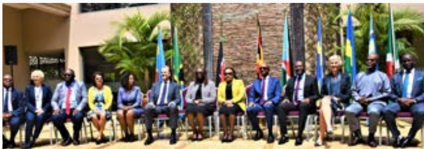
Group Photo : The 2022 Swedish-East African Chamber of Commerce Business and Investment Forum, officially opened by CS Trade Hon. Betty Maina in Nairobi on April 27, 2022

The 2022 Swedish-East African Chamber of Commerce Business and Investment Forum (SWEACC) took place in Nairobi, Kenya from April 27 to 28, 2022 and was officially opened by Hon. Betty Maina, Cabinet Secretary Ministry of Industrialization, Trade and Enterprise and Acting Cabinet Secretary, Ministry of East African Community and Regional Development.