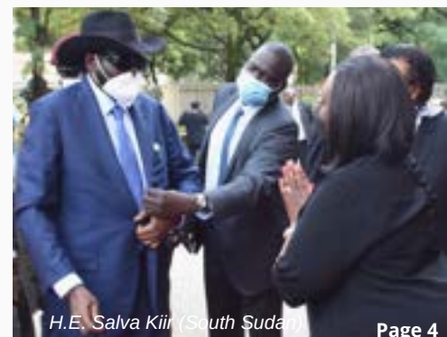
H.E. Salva Kiir (South Sudan)