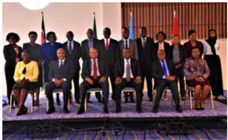
Group photo during the opening ceremony of the Kenya-Mozambique UN Security Council Consultations, in Nairobi on April 11, 2022.

Permanent Secretary H.E. Novela further pointed to the composition of the Mozambican delegation as a demonstration of the seriousness that the government of Mozambique attached to their consultations with Kenya on Council matters.