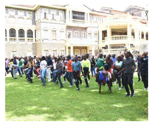
Ministry staff participate in various games during the Staff Wellness day on May 6, 2022

On Friday May 6, 2022, the Ministry celebrated the Staff Wellness Day under the theme " A Healthier Foreign Service for better diplomatic representation "