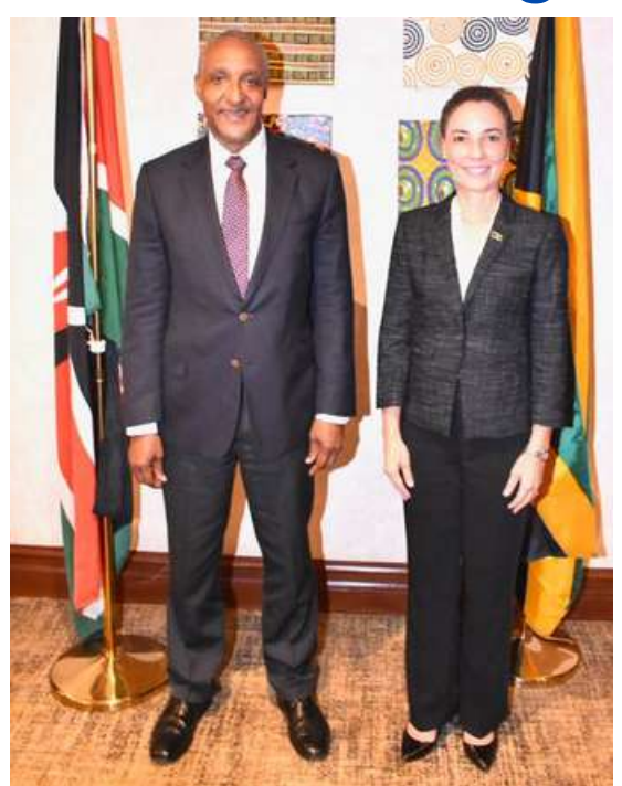
PS Amb Macharia Kamau with Hon. Kamina Johnson Smith, Minister of Foreign Affairs and Foreign Trade of Jamaica on May 10, 2022.