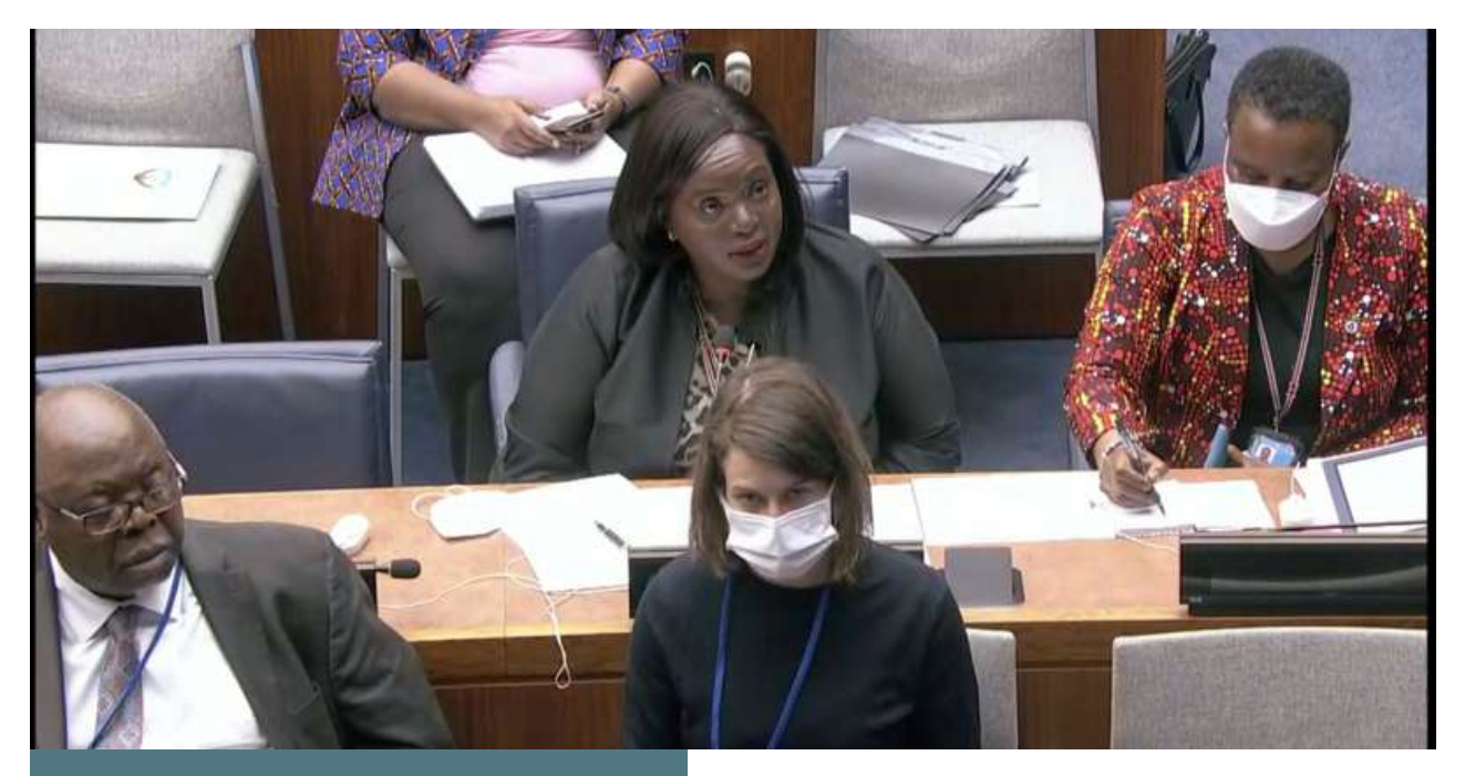
CS Amb. Raychelle Omamo participated at the Ministerial Meeting on Global Food Security Call to Action at United Nations Security Council convened by USA on May 19, 2022

On May 19, 2022, Cabinet Secretary Amb. Raychelle Omamo represented Kenya at the United Nations Security Council (UNSC) ministerial-level open debate on conflict and food security under the agenda " Maintenance of international peace and security "