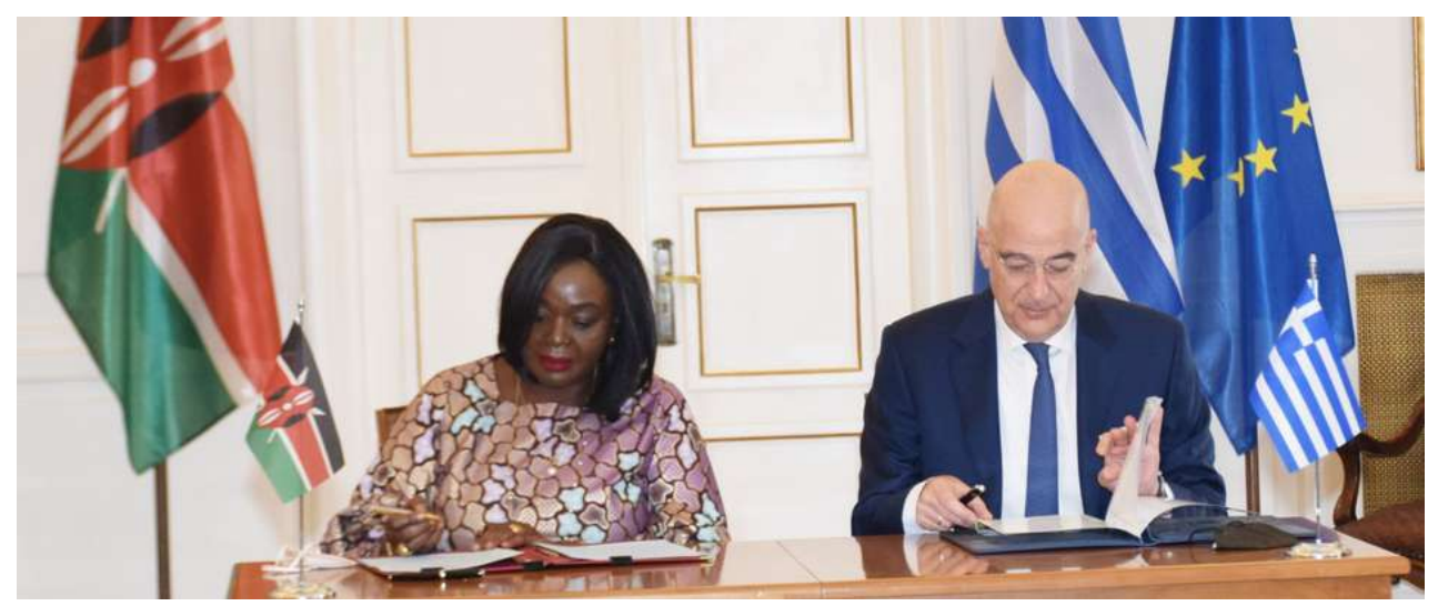
CS, Amb. Raychelle Omamo and the Greek Foreign Minister H.E. Nikos Dendias signed a bilateral Memorandum of Understanding on Cooperation in the Field of Diplomatic Training on May 9, 2022.

The Republic of Kenya and the Hellenic Republic signed a bilateral Memorandum of Understanding on Cooperation in the Field of Diplomatic Training on May 9, 2022.