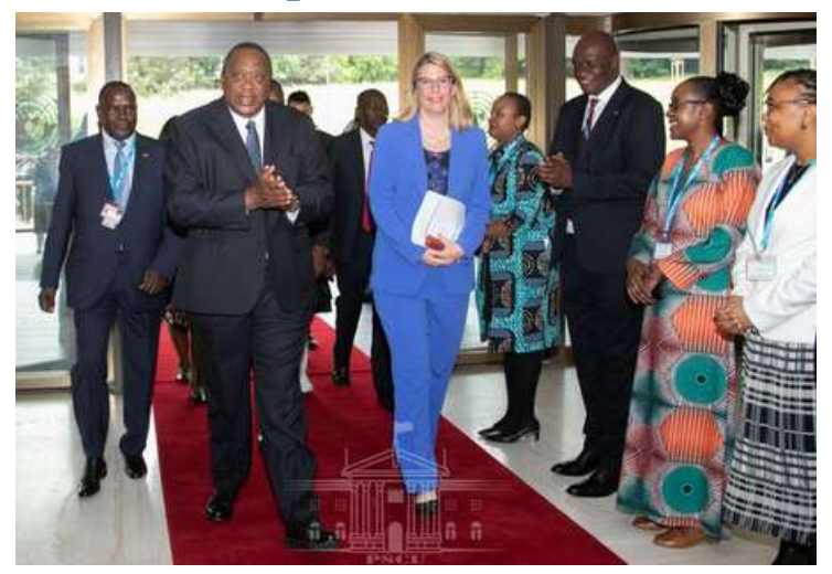
President Uhuru Kenyatta arrives at the World Health Complex in Geneva, Switzerland for the seventy-fifth World Health Assembly on May 22, 2022

The first in-person WHO Health Assembly since the start of the Covid-pandemic took place in Geneva on May 22, 2022 under the theme: "Health for peace, peace for health"