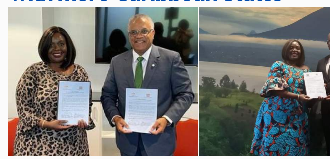
CS Amb. Raychelle Omamo signed Joint Communique on establishing diplomatic relations with Belize Foreign Minister Hon. Eamon Courtenay, Wednesday, June 22, 2022 and signed with Hon. Chet Greene, Minister for Foreign Affairs, Immigration and Trade of Antigua and Barbuda, June 23, 2022.

Kenya is set to host more resident diplomatic missions for Caribbean States. This follows the formalization of diplomatic relations between Kenya and two additional CARICOM members; Belize and Antigua and Barbuda.