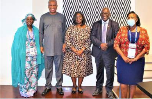
On the sidelines of CHOGM2022 Amb. Raychelle Omamo met with H.E. Geoffrey Onyeama, Minister for Foreign Affairs of Nigeria.