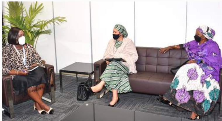
CS Amb Raychelle Omamo met with Amina J. Mohammed, UN Deputy Secretary General at the UNEA5.2 at Gigiri, Nairobi on February 28, 2022