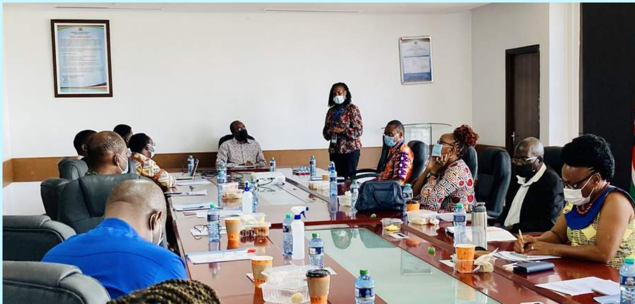
The closing ceremony of the workshop on finalization of Asset Acquisition and Management Plan by the Global Assets Department at Foreign Affairs on February 11, 2022.

The Ministry of Foreign Affairs through the Global Assets Management Division held a week-long workshop on finalization of Asset Acquisition and Management Plan (AAMP), from February 7 to 11, 2022.