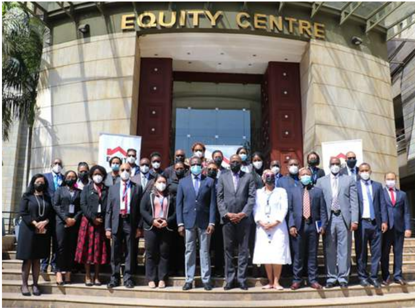
The diplomats' visited the Equity Group Holding Plc.

Representatives from 5 Caribbean countries visited Kenya for an educational tour from January 23 to February 4, 2022.