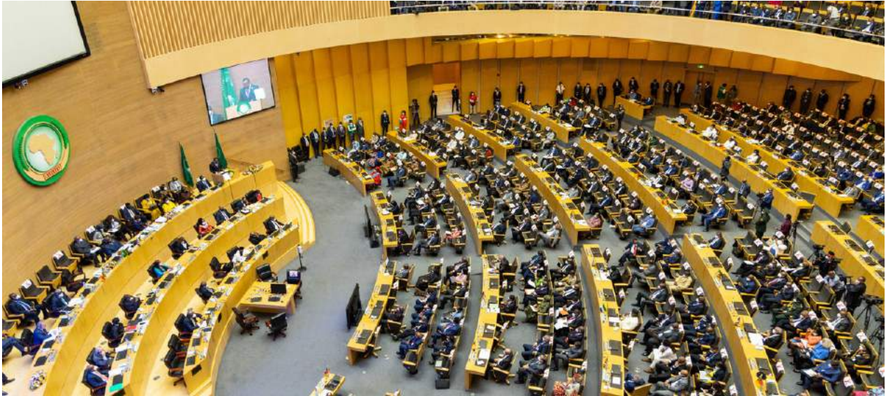
The 40th Ordinary Session of the AU Executive Council held in Addis Ababa Ethiopia on February 2 -3, 2022

The 40th Ordinary Session of the African Union Executive Council started on February 2-3, 2022 in Addis Ababa Ethiopia to deliberate on a number of issues in preparation for the 35th Ordinary Session of the Assembly of the African Union held on February 5 - 6, 2022.