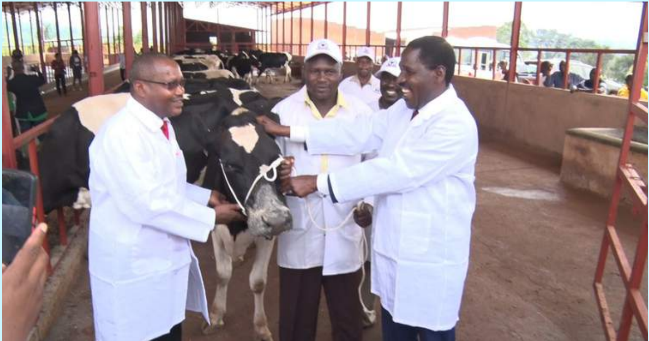
The Cabinet Secretary, Ministry of Agriculture, Livestock, Fisheries and Cooperatives Hon. Peter Munya delivered the President's donation to the Government of Burundi on February 3, 2022.

Kenya continues to take a frontline role in extending assistance to members of the East African Community. In this regard Kenya honoured its commitment to assist Burundi develop its agriculture, livestock and co-operative sectors.