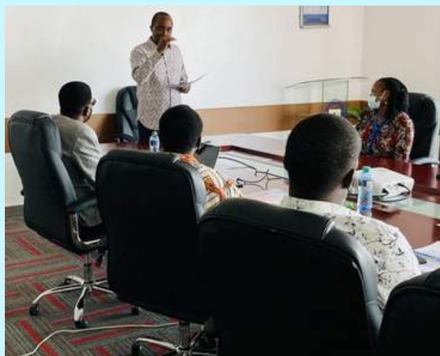
Amb. Isaiya Kabira gives his remarks during the closing ceremony of the workshop on February 11, 2022

He noted that the workshop laid out the importance of the AAMP not only to the ministry, but also to the government as a whole. Amb. Kabira highlighted some of the policy guidelines and implementation strategies that were developed that included; criteria for determining where to own diplomatic properties, categorization of Missions for purposes of property ownership, Optimum property mix for different categories of missions among others.