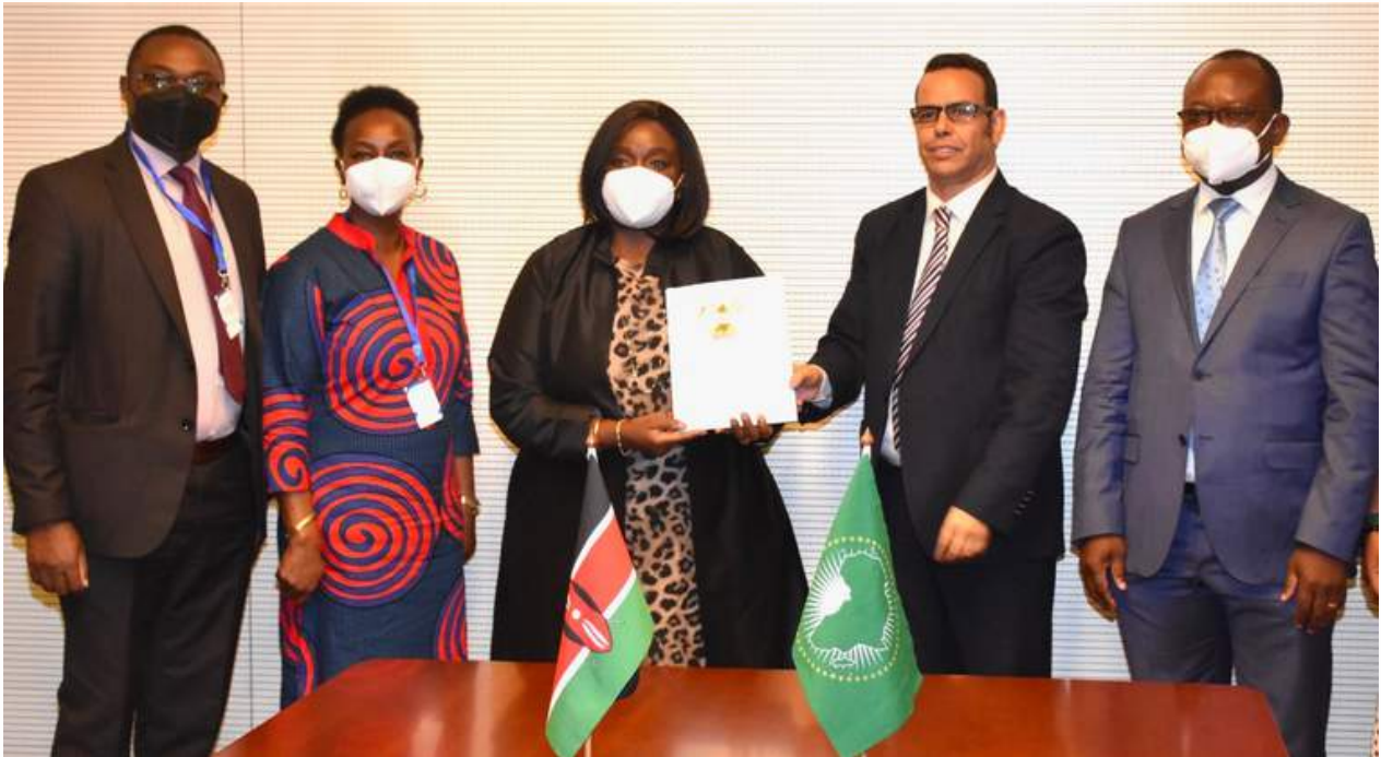
CS Amb. Raychelle Omamo deposited instruments of ratification to the African Charter on behalf of the Republic of Kenya in Addis Ababa, Ethiopia on February 4, 2022

Amb Raychelle Omamo deposited three instruments of accession to the African Union (AU) office of the legal counsel in Addis Ababa, Ethiopia on February 4, 2022.