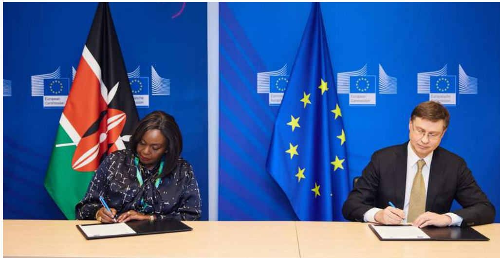
Amb Raychelle Omamo Cabinet Secretary, Ministry of Foreign Affairs and Mr. Valdis Dombrovskis, Executive Vice- President of the European Commission in charge of an Economy that works for People, and Commissioner for Trade, sign Kenya- EU Joint Statement

His Excellency President Uhuru joined other African and European Heads of State and Government for the two-day 6th African Union - European Union Summit held in Brussels, Belgium from the February 17 – 18, 2022.