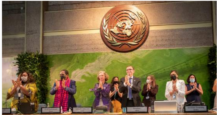
UN Environment Assembly adopts landmark resolution in the push to Beat Plastic Pollution at UNEA5 In a major win for people and planet, nations have committed to develop a legally binding agreement on plastic pollution

Delegates participated at a UNEP run at Armani Gardens, Karura Forest, themed 'UNEP@50 Years Anniversary 10KM commemorative run.' Renowned athletes joined in the race and also participated at an excursion at the Nairobi National Park.