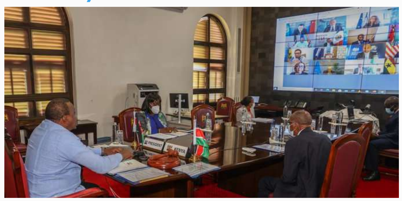
H.E. President Uhuru Kenyatta chaired a virtual United Nations Security Council high-level debate on cooperation between the United Nations, Regional and Sub-Regional Organizations with a special focus on the African Union on October 29, 2021

Kenya has successfully concluded her Presidency of the United Nations Security Council for the month of October, 2021, in what proved to be a historic and consequential month for the country's foreign policy and diplomacy.