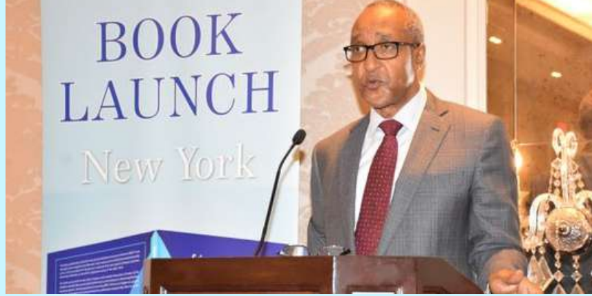
PS Amb. Macharia Kamau hosted a high-level Blue Economy side event on the sidelines of Kenya's Presidency of the United Nations Security Council for the month of October in New York, USA on October 15, 2021.

The Principal Secretary also highlighted two forthcoming events that provide opportunity for building momentum to the 2022 Oceans Conference. The events beingUNEP@50 Commemorations scheduled for March 2022 at UNON in Nairobi, and Stockholm+50 co-hosted by Kenya and Sweden on June, 2022.