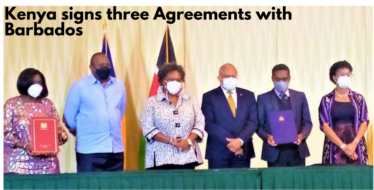
On October 7, 2021, Kenya and Barbados signed three agreements: Trade and Investment; Air Service Agreement; and Development of the National Botanical Gardens of Barbados. CS Amb Raychelle Omamo signed for Kenya in the presence of H.E President Uhuru Kenyatta and H.E Mia Mottley Prime Minister of Barbados.

On October 7 2021, Kenya signed three bilateral agreements with Barbados that are meant to promote and enhance bilateral and trade relations between Kenya and the Island nation. The agreements on Trade and Investment, Bilateral Air Service and the International Section of the National Botanical Garden were signed following a Joint Business forum and a Joint Commission for Cooperation JCC.