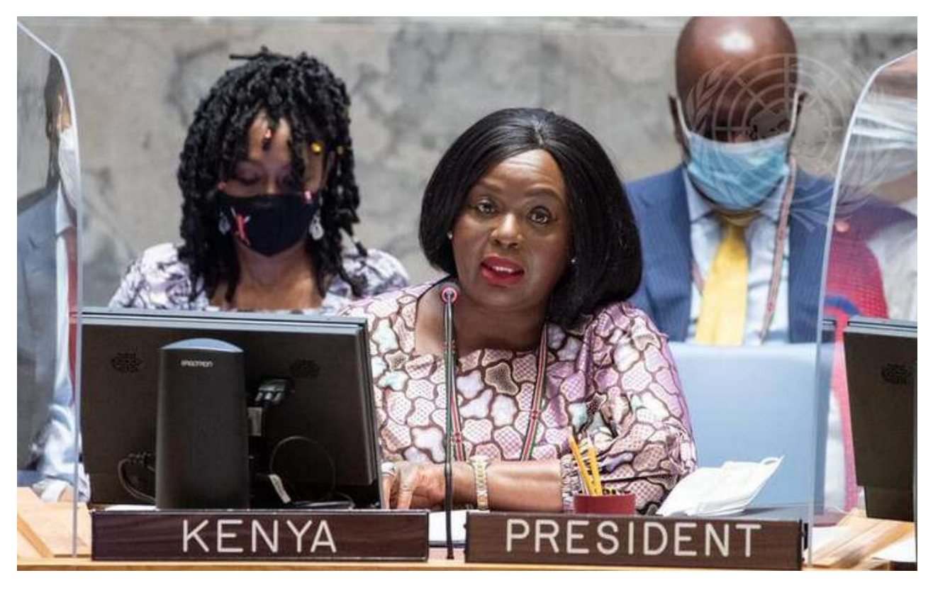
Cabinet Secretary Amb. Raychelle Omamo, presides over the 21st Annual Debate on Women and Peace and Security at the United Nations Security Council in New York on October 21, 2021

On October 21, 2021 Kenya opened up the Security Council Chamber for the first in-person participation by the wider United Nations Membership since the outbreak of the Covid-19 pandemic.