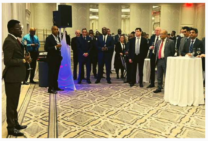
CAS Hon. Ababu Namwamba at a reception hosted for all UN Member States at the conclusion of Kenya's Presidency of the Security Council in New York, USA on October 30, 2021

It is worth pointing out that the conclusion of Kenya's Presidency of the Security Council was marked by a series of events, which included an interactive briefing to the United Nations members. This took place on October 29, 2021, during which the wider UN Membership paid tribute to Kenya for the exemplary stewardship of the affairs of the Security Council.