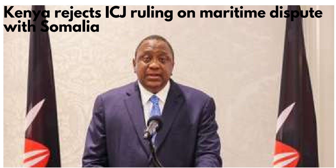
On October 13, 2021 H.E. Hon. Uhuru Kenyatta, CGH, President of the Republic of Kenya and Commander in Chief of the Defence Forces issued a statement on the International Court of Justice judgement in Maritime Delimitation Case while in New York, USA

On October 13, 2021, Kenya expressed dismay over the International Court of Justice (ICJ) ruling on the Maritime Delimitation in the Indian Ocean case between Kenya and Somalia.