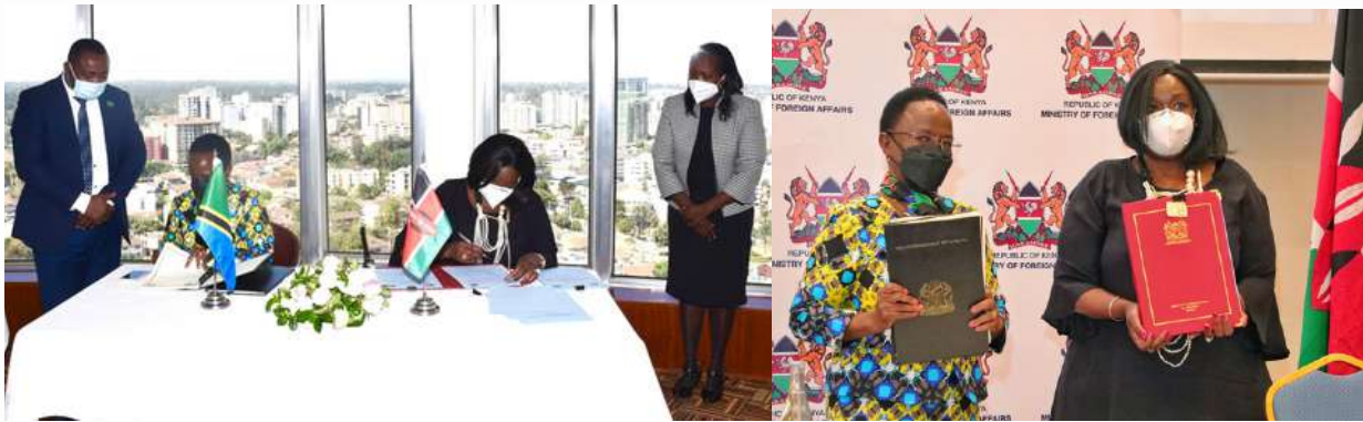
CS Amb. Raychelle Omamo and her Tanzanian counterpart, Hon. Amb. Liberata Mulamula during the 4th Session of JCC discussions in Nairobi on August 24, 2021

The 4th Session of the Joint Commission for Cooperation (JCC) between the Republic of Kenya and the United Republic of Tanzania was held in Nairobi from August 19 - 20, 2021. The session was convened as a follow up to the successful maiden visit by Her Excellency Samia Suluhu Hassan, President of the United Republic of Tanzania to the Republic of Kenya on May 4 -5, 2021.