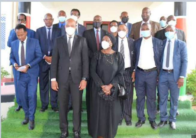
Cabinet Secretary Amb Raychelle Omamo with her Somalia Counterpart Mohamed Abdirizak and Kenya Embassy Staff at the new premises of the Chancery of the Embassy of Kenya in Somalia on August 8, 2021.

At the conclusion of the State Visit, the two ministers undertook to continue holding regular consultations on issues of mutual interest.