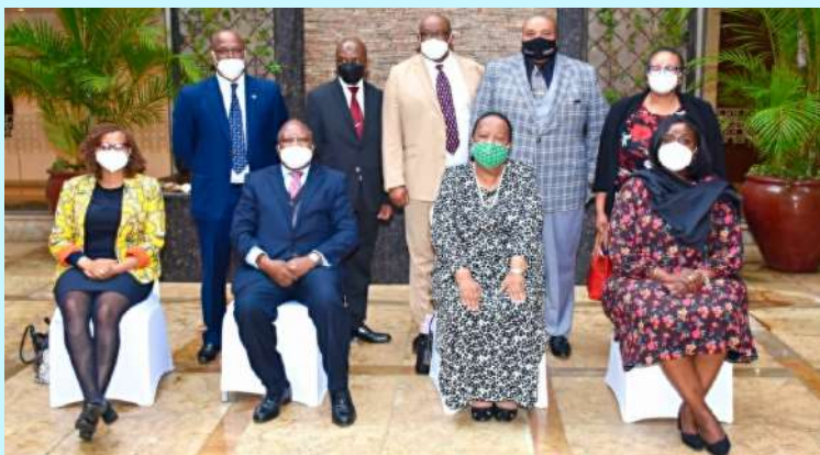
Cabinet Secretary Amb. Raychelle Omamo with her South African counterpart Dr. Naledi Pandor, in a group photo during the Inaugural Session of the Kenya-South Africa Joint Commission for Cooperation held in Nairobi on August 11, 2021

They lauded the JCC as an opportunity for Kenya and South Africa to robustly engage in advancing the common African agenda of pursuing economic prosperity in the spirit of pan-Africanism and progressive liberal democracy. The two leaders reiterated the urgency of defending the Afro-centrist values in shaping the trajectory of African people.