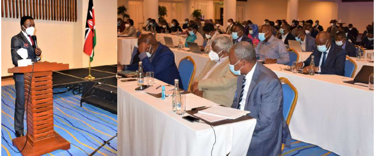
CAS Hon. Ababu Namwamba presided over the official opening of the meeting of senior officials in preparation for the 4th Session of Kenya-Tanzania Joint Commission for Cooperation (JCC) in Nairobi on August 20, 2021.

Following the State Visit to Kenya in May 2021 by Her Excellency Samia Suluhu Hassan where two Memorandums of Understanding on Joint Technical Commission meetings were signed, the two East African nations continue to work together for the mutual benefit of their people.